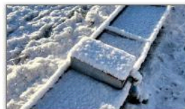
SNOW TIPS AS OUR AREA WAS HIT WITH A COLD SPELL OR TWO THIS WINTER