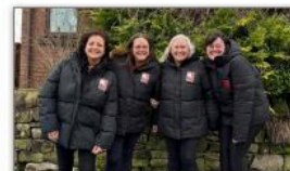
NEW MERCH! OUR WHOLE TEAM WAS KITTED OUT IN WARM AGNEW GEAR